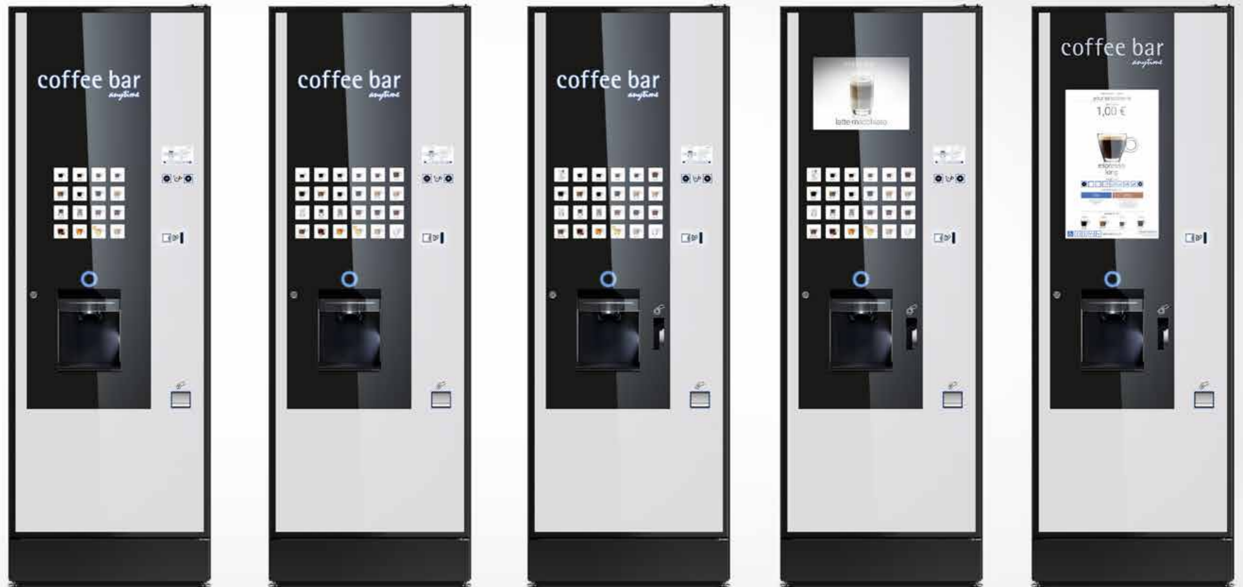
luce zero.0 where it all started

This looks a lot like a row of five models from the luce zero range. But in fact it is much more than that. Because each machine is designed to adapt to growing demand, in terms of both performance and features. What this means for vending operators is that any of the luce zero models can be modified to become even more productive, more efficient and more flexible - without having to go out and buy a new machine.