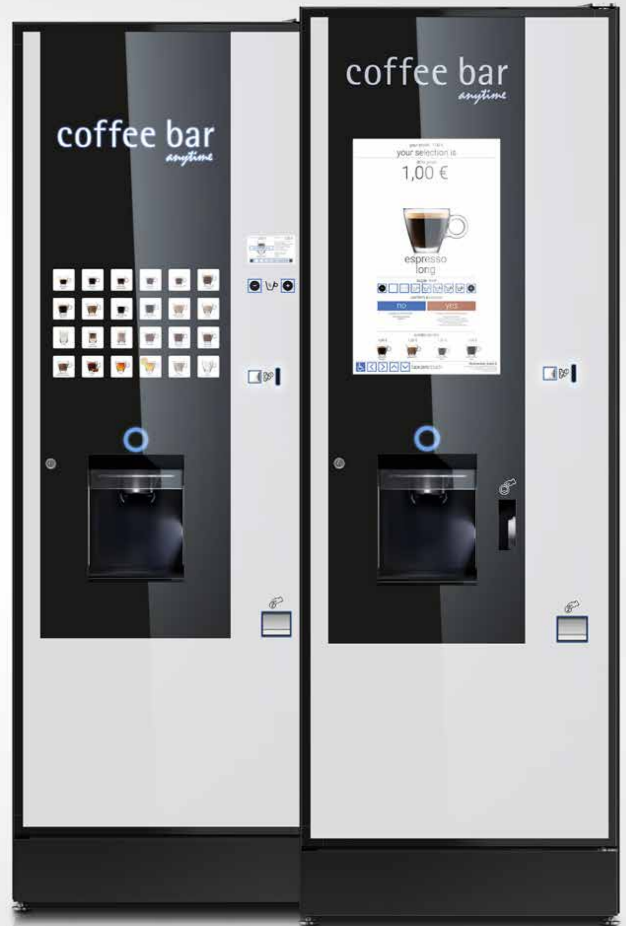
The luce zero.1 and luce zero.touch