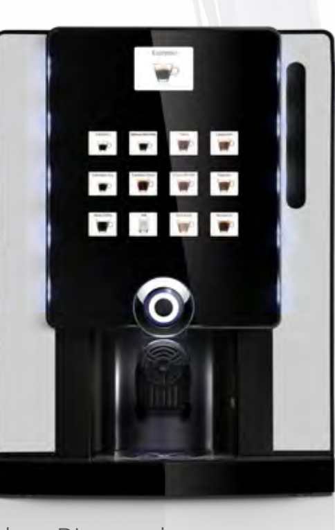
rhea BL grande 2 machines in one

Slim, compact, seductive, 3 canisters for products, plus water for tea in the espresso version.