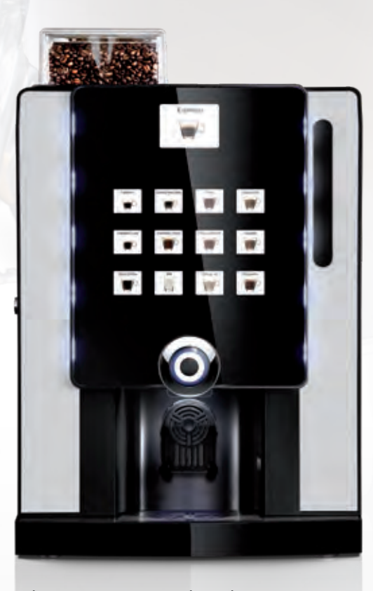
rhea BL grande vho freshness you can see

Hybrid technology with the Xtra canister for personalized products like Fairtrade Instant or lactose-free powdered milk.