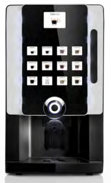
rhea BL eC hi-tech meets Italian style

Because all models are equipped with variflex brewing technology, the Business Line guarantees remarkably light and delicious Italian coffee specialties like classic espresso, cappuccino and latte macchiato, or international styles like American coffee and café crème.